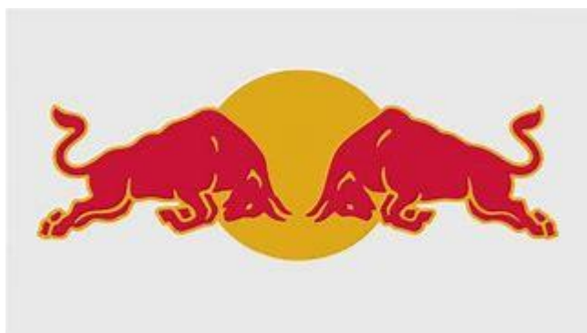
Red Bull Statue

Colleagues may recall the theft of numerous trophies from the Red Bull reception area at Stewart House – and the recovery of said trophies from a lake at a golf course some days later.