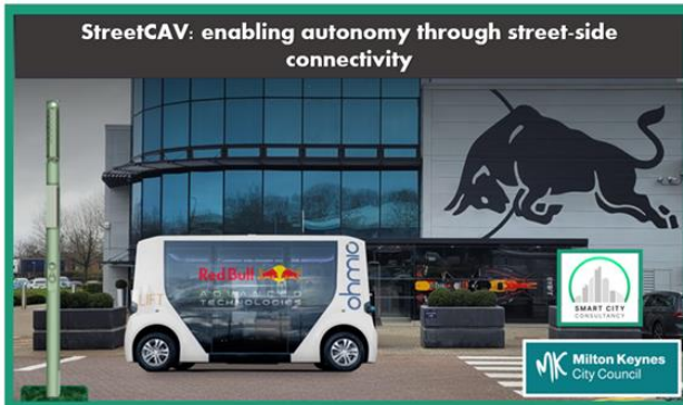
Self-driving shuttles coming to Milton Keynes

Last week the Council of Faiths brought together leaders from various faiths with the Mayor and Mayoress for the annual Mayor's reception. The event is to encourage the sharing of ideas and perspectives around faith, the role it plays in the city, and to celebrate our diverse communities.