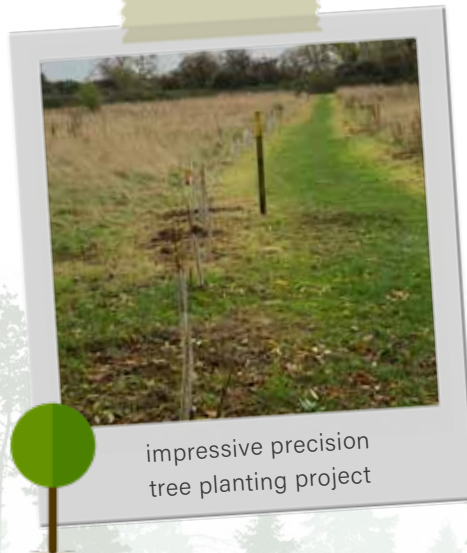
impressive precision tree planting project

The pupils had the opportunity to visit the warehouse for themselves and find out exactly how our contributions reached the tables of the people who need them. Thank you to MK Food Bank for taking the time to speak to us about the brilliant work you do!